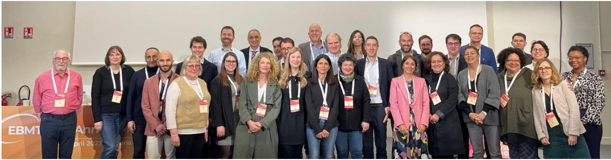
ADWP Team during the 49th Annual Meeting of the EBMT in Paris

therapies for ADs. Moreover, a section specifically designed for ADs was developed within the EBMT e-learning platform with contributions from key experts in the field.