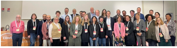
ADWP Team during the 49th Annual Meeting of the EBMT in Paris

therapies for ADs. Moreover, a section specifically designed for ADs was developed within the EBMT e-learning platform with contributions from key experts in the field.