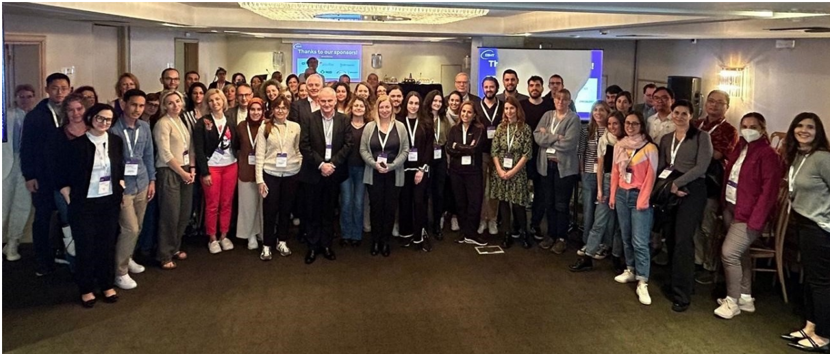
26th Infectious Diseases Working Party Educational Course 16 - 18 November 2023 Athens, Greece