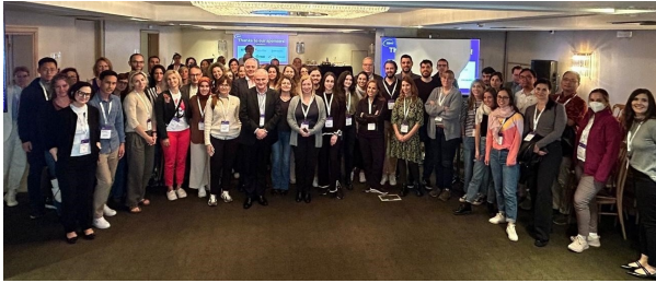
26th Infectious Diseases Working Party Educational Course 16 - 18 November 2023 Athens, Greece