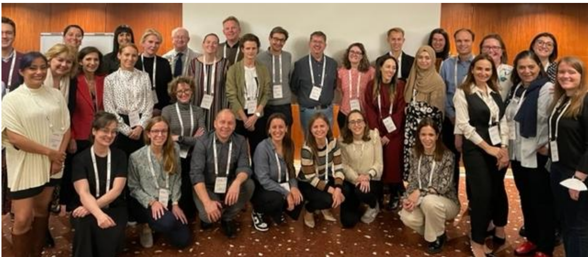
JACIE Inspector Training Course - 17 November 2022 - Castelldefels

The inspections are carried out by the trained, volunteer inspectors who share their professional expertise to inspect against the Clinical, Collection, Processing and Quality Management Standards. Currently, there are approximately 300 inspectors across Europe, Middle East and Latin America. November 2022 saw a return of the Inspector training programme. The training model now includes e-learning modules for the theoretical content with one day workshop focussing on developing the best practice for the inspection itself including pre-inspection preparation and post-inspection reporting.