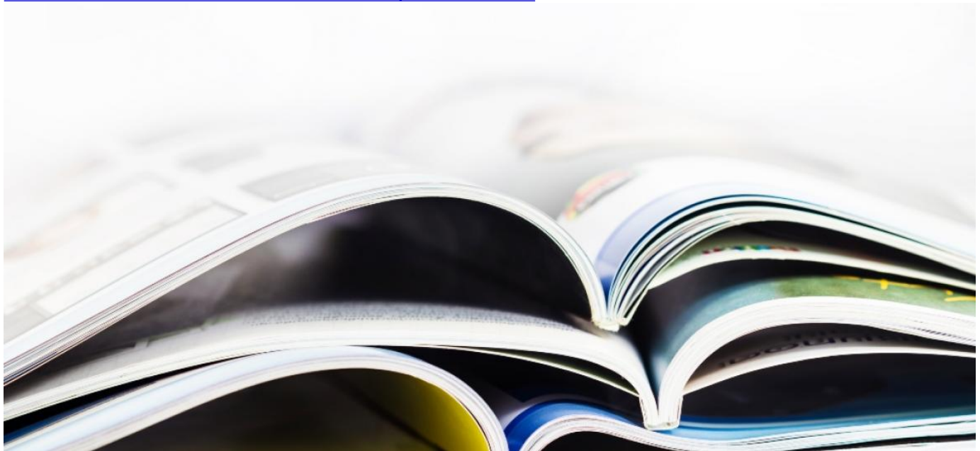
Impact factor (Chronic Malignancies)

See the full list of the CMWP 2020 publications