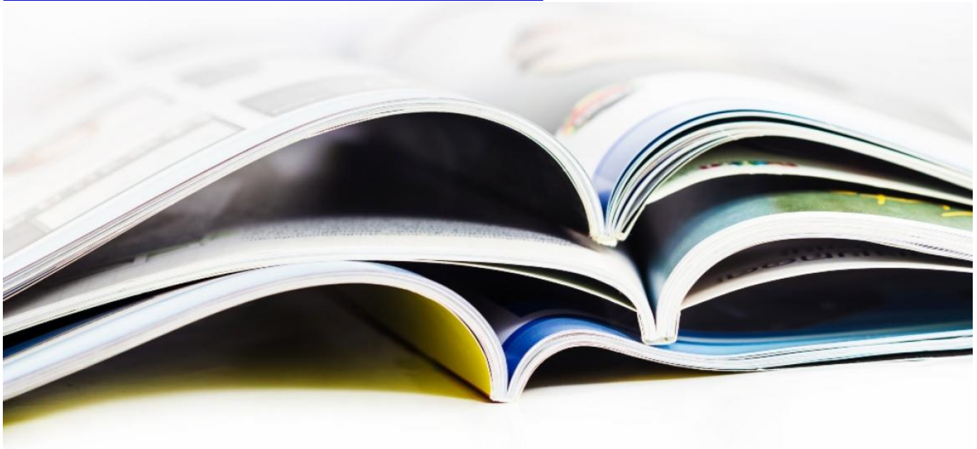
Impact factor (Aplastic Aenemia)

See the full list of the SAAWP 2020 publications